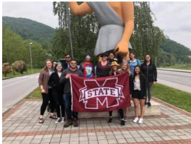
2 - Bioarchaeology in Croatia