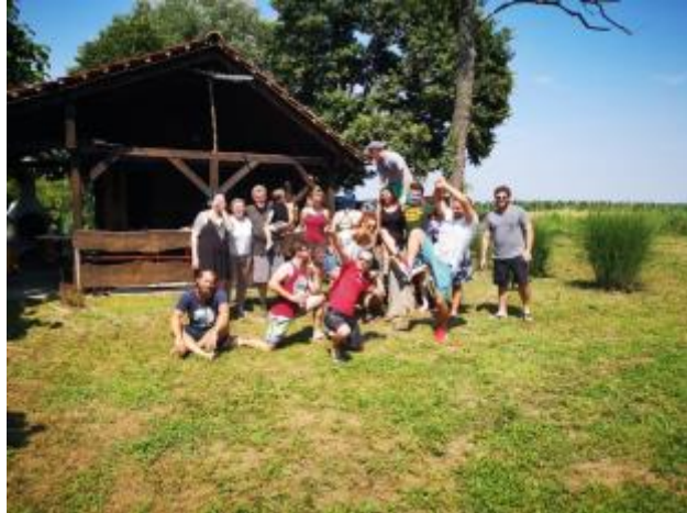
3 - Bioarchaeology in Croatia