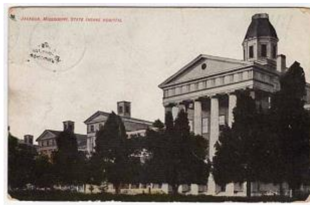
4 - Mississippi State Asylum